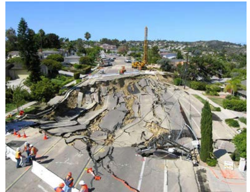
Mount Soledad Landslide (California)