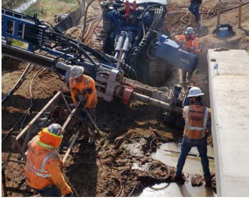
Port of San Diego Sweetwater Promenade (California)