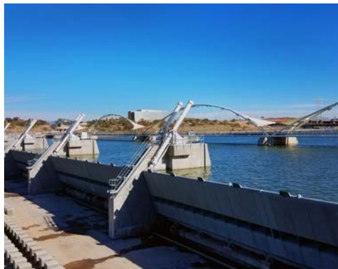
Tempe Town Lake Dam (Arizona)