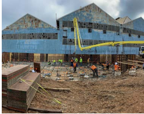
Port of Houston Clinton Terminal Concrete Silo Slip (Texas)