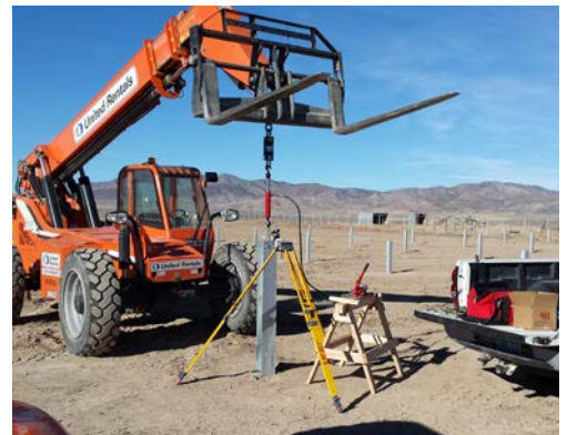
Hunter Solar (Utah)