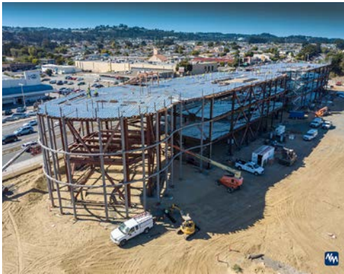
City of South San Francisco Civic Complex (California)