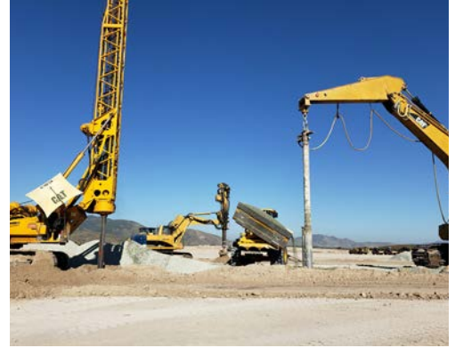
Fulfillment Warehouses (California, Arizona, Nevada)