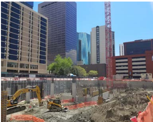
The Fitzgerald (Colorado)