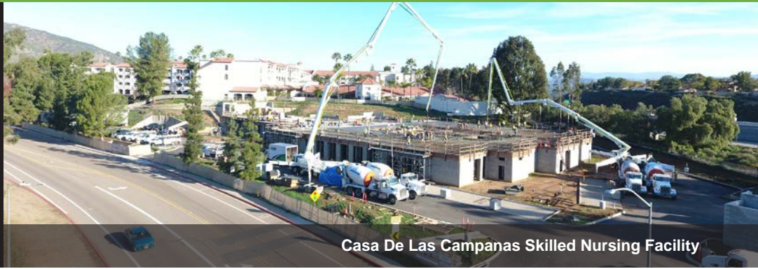
Casa De Las Campanas Skilled Nursing Facility