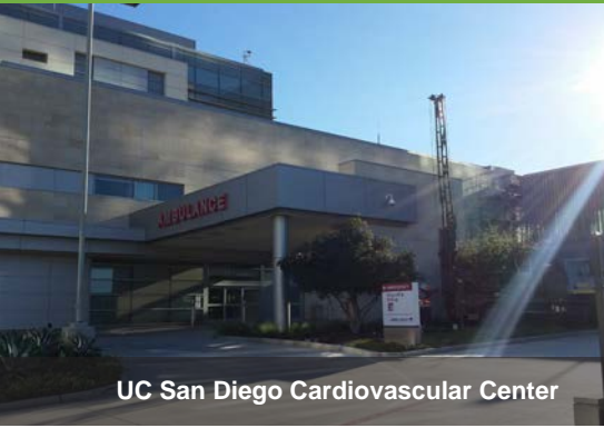
UC San Diego Cardiovascular Center