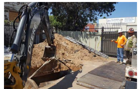
National City Family Health Center