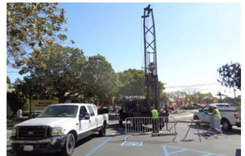
North Coastal Health and Human Services Facility