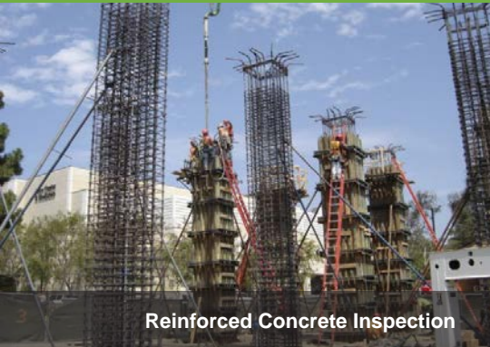
Reinforced Concrete Inspection