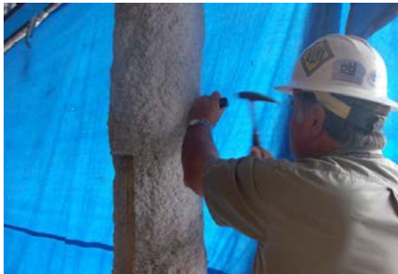
Fire Proofing Inspection