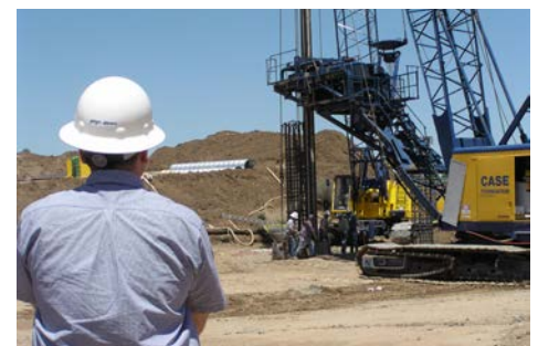
Deep Foundation Inspection