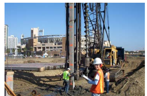
Pile Driving Inspection