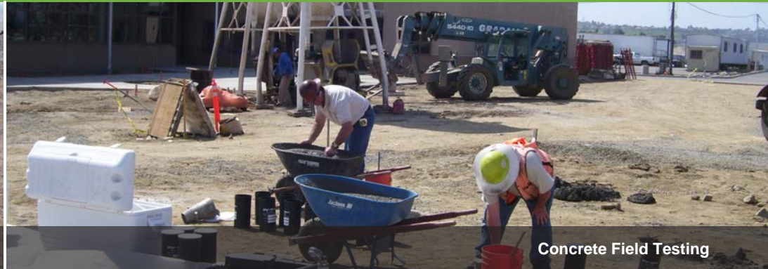
Concrete Field Testing