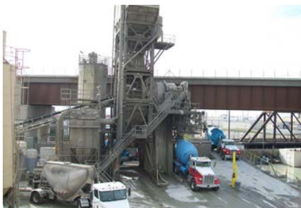
Concrete Batch Plant Inspection