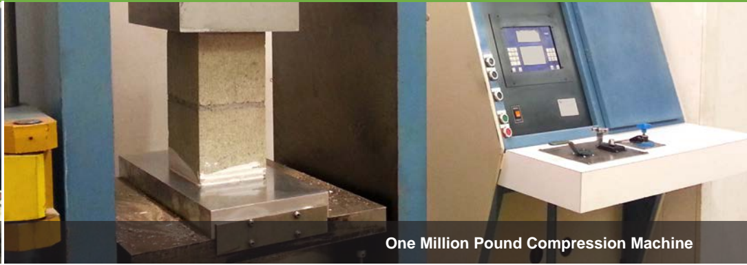
One Million Pound Compression Machine