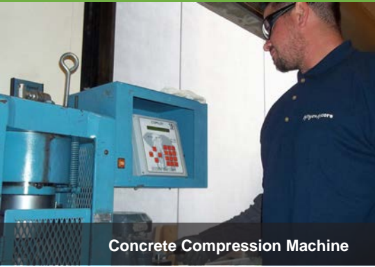
Concrete Compression Machine