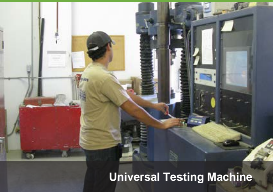
Universal Testing Machine